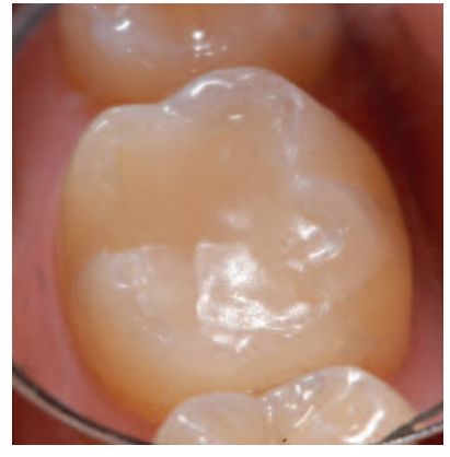
Fig. 6: Composite (occlusal-distal) filling 3.5 years after restoration of tooth 36. The patient reported about no discomfort on tooth 36 at any time after indirect pulp capping, e.g. upon contact with cold food, drinks and air, or other subjective symptoms.