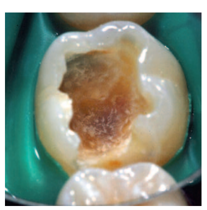
Fig. 2: Cavity preparation under rubber dam and incomplete caries excavation on tooth 36.